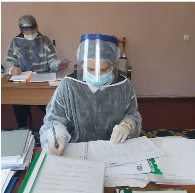
Photo of the Office of Public Defender of Georgia during one of the monitoring visits

In July 2020, the Irish Human Rights and Equality Commission submitted its report The Impact of COVID-19 on People with Disabilities to the Irish Parliamentary Committee on Covid-19 Response. Informed by the deliberations of the Commission's Disability Advisory Committee, the report identifies how the Covid-19 public health emergency has given rise to significant risks of discrimination and the undermining of rights for persons with disabilities in a range of areas. With the report, the Commission recommends that an explicit human rights and equality-based approach that is fully inclusive of people with disabilities be taken to responding to Covid-19. In September 2020, the Commission made another submission to the same Parliamentary Committee, namely Submission to the Special Committee on COVID-19 Response Regarding the Adequacy of the State's Legislative Framework to Respond to COVID-19 Pandemic and Potential Future National Emergencies . The submission notes that the pandemic has exposed gaps in the State's legislative framework, including gaps in respect of disability rights. The submission also notes issues concerning the accessibility of public health information. See the details here .